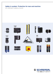
AS-I System Solutions 40 pages