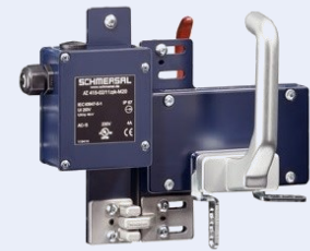
STS30 door handle assembly with integrated actuator for the AZ16, AZ3350, AZ415, AZM161, or AZM415