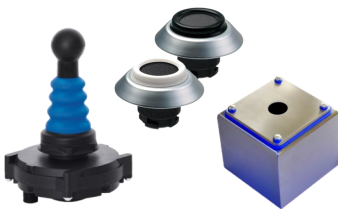
Joysticks, Pushbuttons & Enclosures