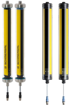
Safety Light Curtains and Grids