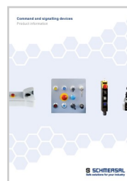
Command and Signaling Devices