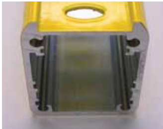
Rugged closed housing profile