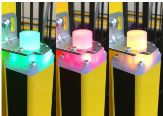
Output and reset status LED endcap