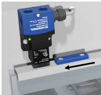
Sliding guard, approach from side