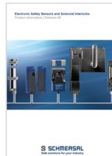
Electronic Safety Sensors and Solenoid Interlocks Catalog