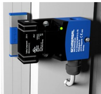
Magnetic latching option