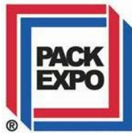
Exhibit at Pack Expo

Schmersal is exhibiting at this year's Pack Expo in Las Vegas, NV on September 23-25. Learn more about machine safety with our hands-on demonstrations and touch screen displays with interactive animations of applications. Visit us in Central Hall booth 5128