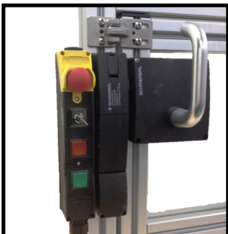
BDF200 fits standard housing extrusions and aesthetically matches our AZM201.