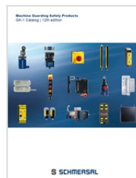
GK-1 Products Catalog page 2-18