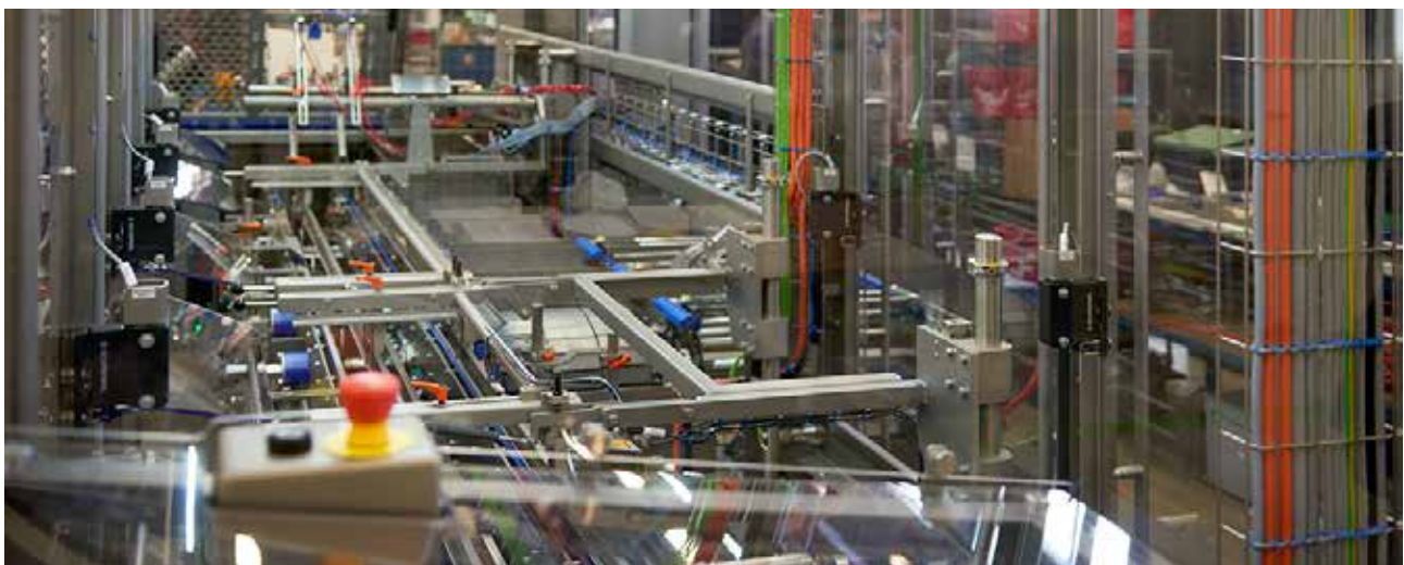
Different concepts for machine safety: „Safety integrated“ or „Safety separated“.