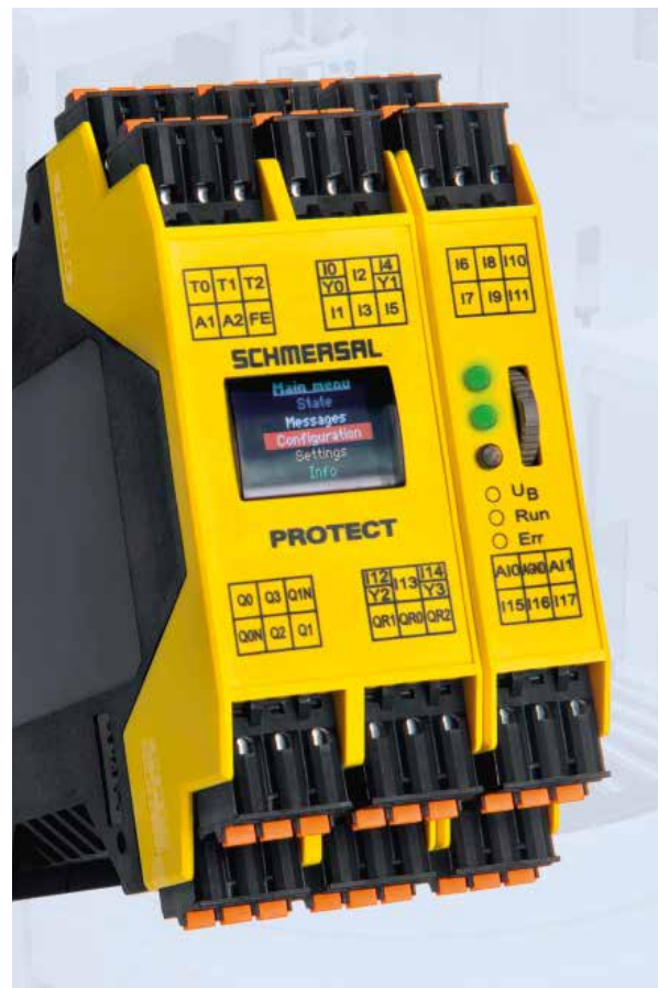
Developed for applications with a manageable number of safety switchgear devices – the parametrisable compact safety controller Protect Select.

If we compare safety solutions based on relay modules with those based on state-of-the-art control technology, whether safety integrated or safety separated, it becomes clear that from a certain complexity of the safety functions onwards, the effort required for wiring, documentation and validation of the module solution is disproportionately high. →