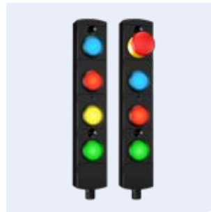
BDF40 Control panel with or without emergency stop