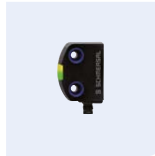
RSS260 Safety sensor