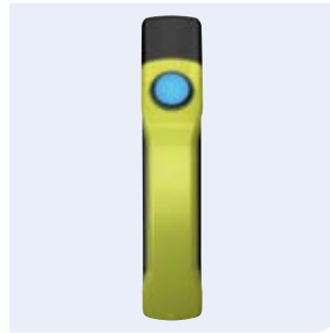
DHS-U1 Door handle