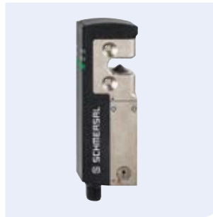
AZM40 Solenoid interlock