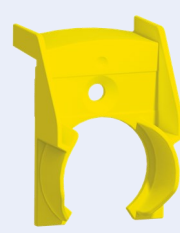
■ MS-BDF40-NHK protective collar for E-Stop

■ Illuminated pushbutton caps (transparent)