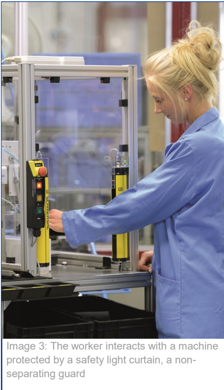
Image 3: The worker interacts with a machine protected by a safety light curtain, a non-separating guard

distance, again creating a false sense of safety.