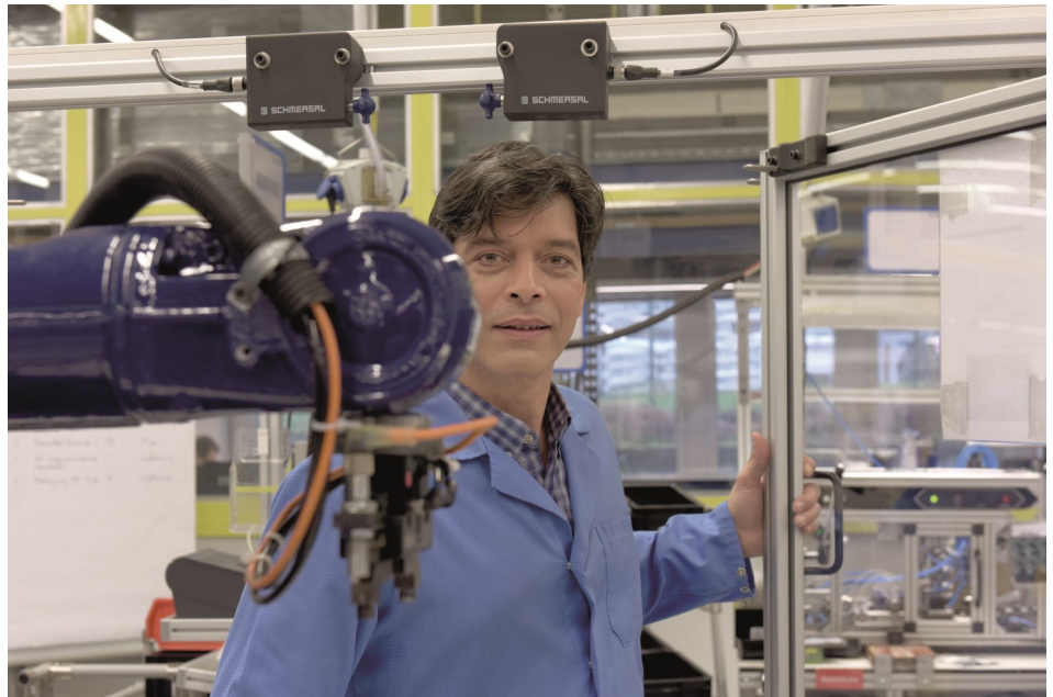
Image 1: worker enters a robot cell protected by a guard door with safety interlock switches.

Applying safeguards to equipment and machines may lead to a false sense of safety if not applied correctly. One practice which is often overlooked is determining the minimum safe distance or height at which a hard guard or protective device should be installed. Many times a hard guard will be installed which can easily be bypassed by reaching over, around or through. Also, safety devices such as light curtains are often installed too close to the hazard point where residual danger still exists once the light curtain is interrupted. Performing a safe distance calculation is crucial to ensure selected safeguarding practices will actually function as desired.