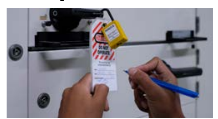
A review of Lockout Tagout requirements.

LOTO is an OSHA legal obligation, and this course helps you understand what is required to comply. Attendees will review OSHA and ANSI regulations pertaining to the LOTO process, the required training programs and practical use.