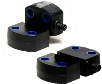
2 actuator approach directions