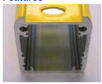
Rugged closed housing profile: