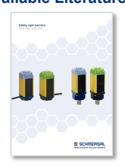
SLB Brochure, 4 pages